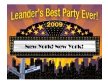
Sat., Sep. 19, 2009 6:30 - 11 PM Renaissance Hotel

The Leander Business Circle is co-sponsored by the City of Leander and the Greater Leander Chamber of Commerce.