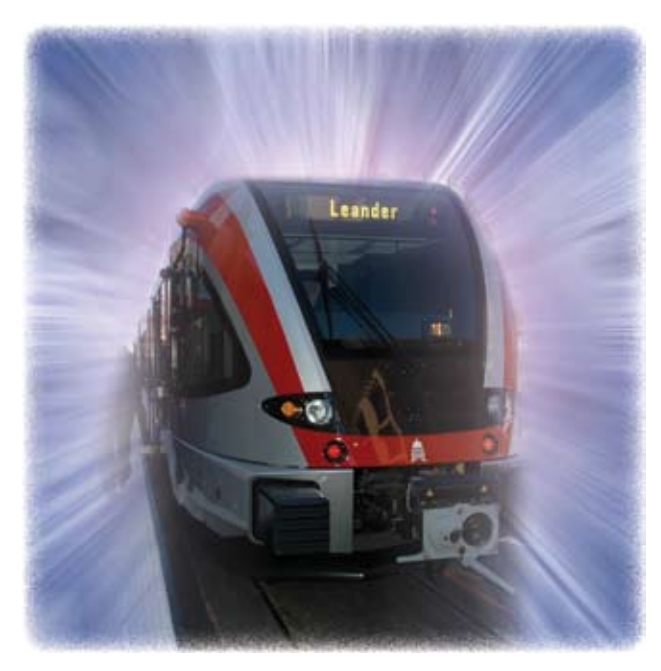
Riding Capital MetroRail: Service begins Mar. 30 with trains running weekdays every 30 minutes during morning and evening rush hours. For additional information pick up a brochure from the Leander Chamber.

The future of transportation is here, and Leander (with Capital Metro and Austin) is leading the way in Central Texas.