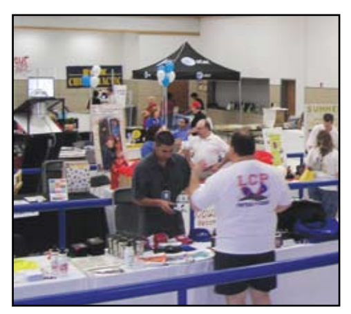
1st Annual Leander Business Showcase (2007) —More than 60 vendors and sponsors displayed retail products and services.

Mark your calendar for the next big community event, the 2nd Annual Leander Business Showcase . On Sat., May 3, the Leander High School will be abuzz from 10 AM to 2 PM with over 60 local vendors and community resources (Leander's Fire Dept., Parks & Rec., and more), showcasing their best just for you. Bring your friends and family to discover unique products